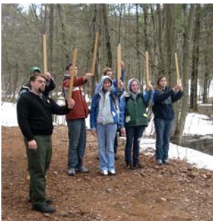
Envirothon Team using Biltmore sticks during a forestry challenge.

NH Envirothon, affiliated with Canon Envirothon ( www.envirothon.org ), and operated locally by the New Hampshire Association of Conservation Districts ( www.nhacd.org ), is an environmental education program for high school students. Students work together to learn about natural resources and environmental issues. They test their knowledge on aquatic ecology, forestry, soils & land use, wildlife and current issues by competing against teams from across the state. The winning team represents New Hampshire at the Canon North American event. The NH team has placed within the top five several times during the 17 years that the state has been involved