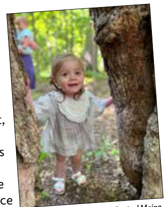
Educare Central Maine

Do you have trees in your nature-space, outside your window or lining your street? Trees are all around us, and they provide a multitude of opportunities to spark wonder in young learners. Join us as we investigate, identify and befriend trees to deepen our understanding of place and strengthen our connections with the natural world. Exploring trees naturally lends itself to rich, sensory experiences for young learners. In this hands-on workshop we will engage with topics including the basics of identifying trees in winter, mapping with trees, arts integration, mindful movement, and branching out with trees across the curriculum. We will discuss ways to modify activities for indoor or outdoor learning. Bring your favorite tree-themed picture book or resource to share with the group!