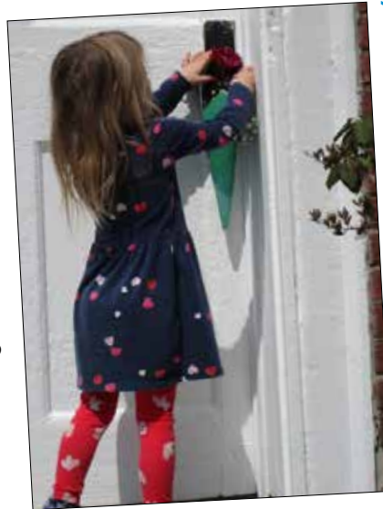
Harrisville Childrens Center